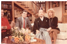
Regis Philbin Morning Show, 1984