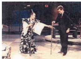
David Letterman Show, 1988